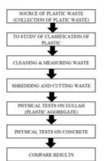
Flow chart No.2.1: Plan of Experimentation

1. Collection of plastic waste: The waste obtained from recycled plastic pipe plant at M.I.D.C. Jalgaon. The waste is known as