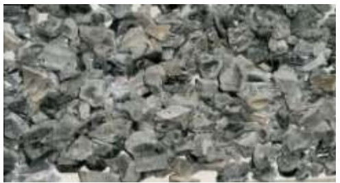
Figure No.2.2: Plastic waste after Shredding and cutting

thrown are collected and resold in a new packaging, giving impression of being fresh, resulting in the spread of deadly diseases. The shredder shreds all kinds of waste like syringes, needles, glucose bottles, mineral water bottle, plastic lumps, pellets, wood paper, cardboard etc.