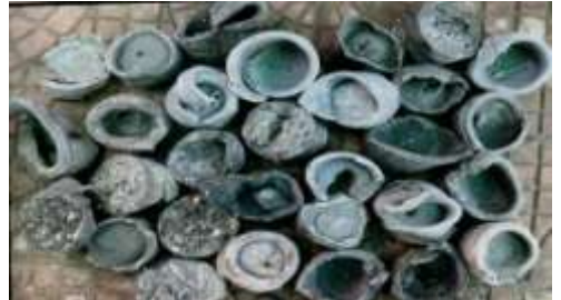
Figure No.2.1: Plastic waste collected from Factory

Gullah material which is obtained in process of production of recycled pipes. This material generally obtains in cylindrical shape.